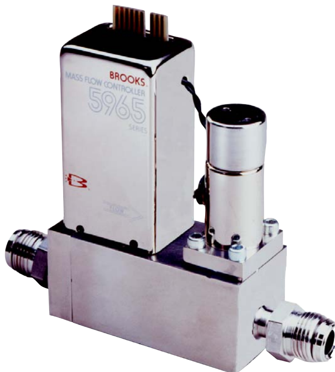
Model 5965 Metal Seal MFC

High Performance Metal Seal High Flow Mass Flow Controller